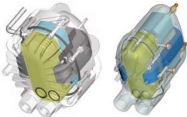
PlusPack 3-in-1 heat exchangers (patent pending), in solid aluminium with air-to-air free-cooler exchanger, evaporator and 'slow flow' demister separator and integrated air connections.